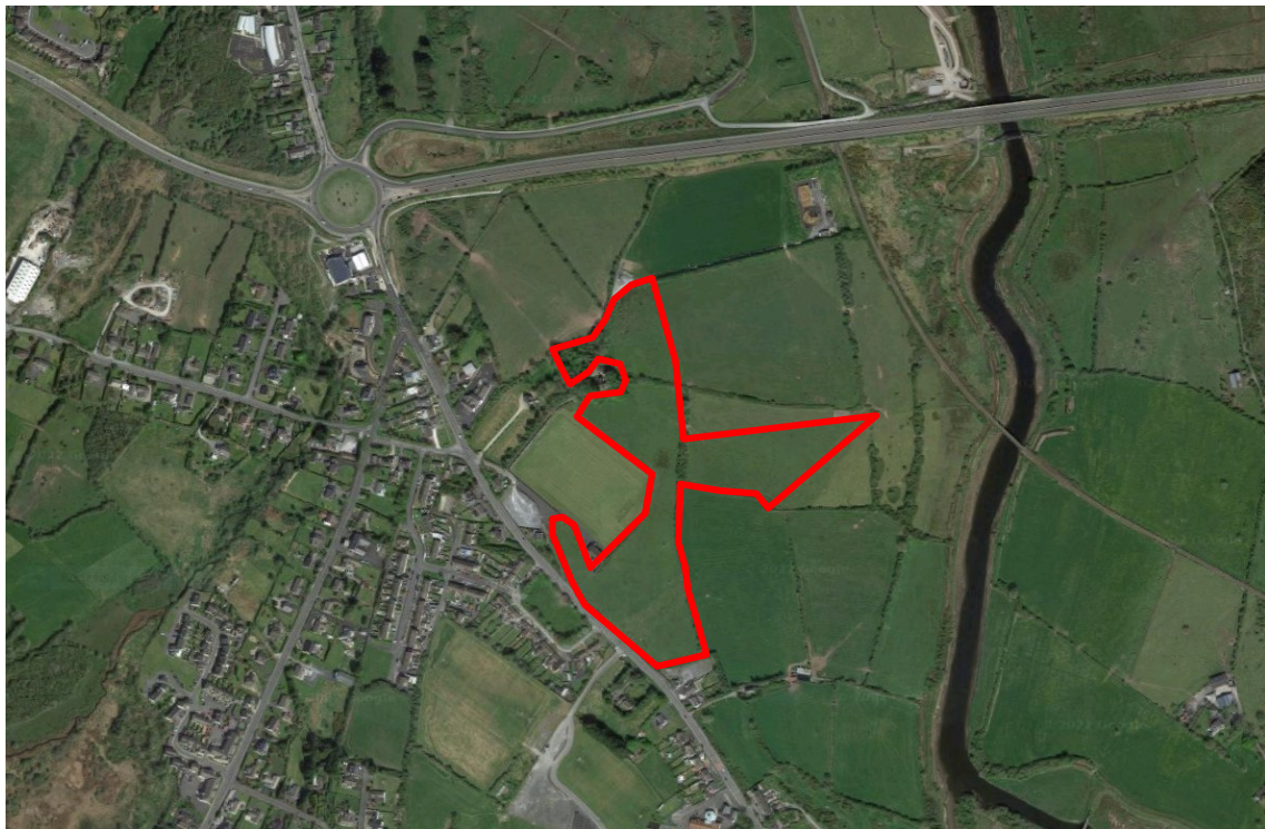
Figure 1.1: Indicative extent of subject lands

As outlined in my previous submission to the Draft CDP, and as indicated in Figure 1.1 below, the subject lands (approximately 7.15ha) are strategically located to the south of the Ennis settlement centre, south of the N85 and west of Clare Road offering excellent connectivity opportunities. The lands are advantageously positioned in terms of their proximity to Ennis town centre. The site further benefits from its contained and coherent landholding owned by a single-party and adjoins an established residential setting further highlighting the opportunity to tie with an existing residential community. It should also be reiterated that the site's single party ownership offers a degree of certainty in terms of development intent for the lands and presents a viable opportunity to deliver an integrated plan led development response to currently underutilised lands.